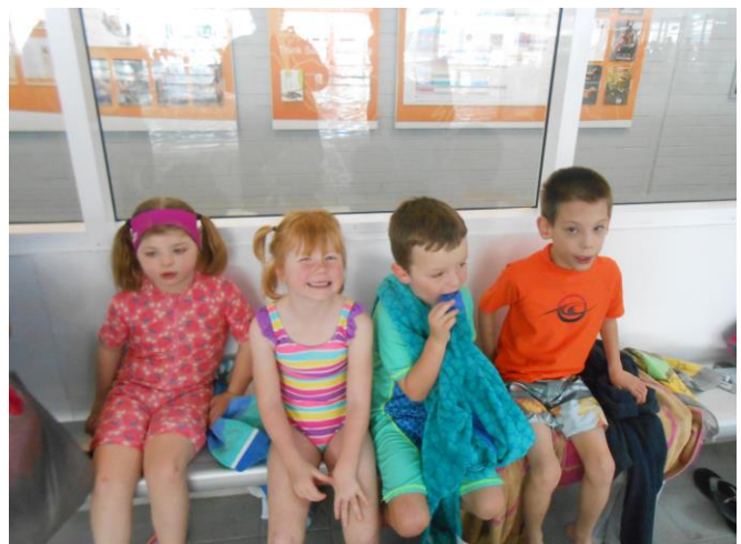
Our room 1 students are excited and can't wait to get into the pool.