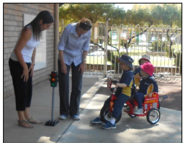
The electronic traffic lights are lots of fun and a great way to learn some basic road safety.