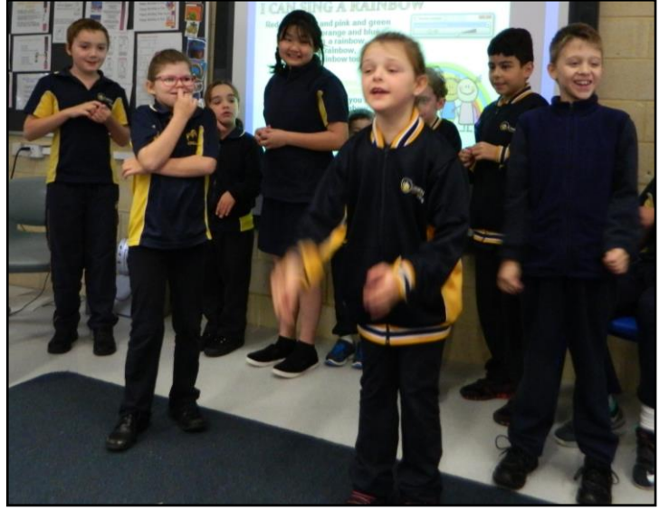
Audience members were invited up to help sing and sign the Rainbow Song.