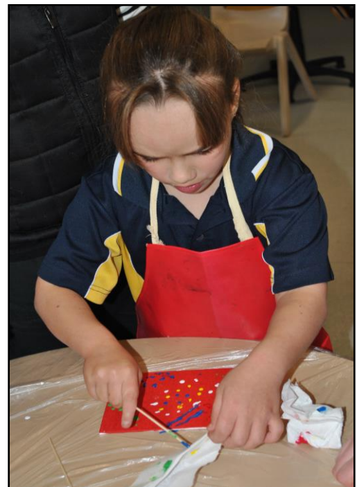
It was important to wipe the painting sticks clean between colours.