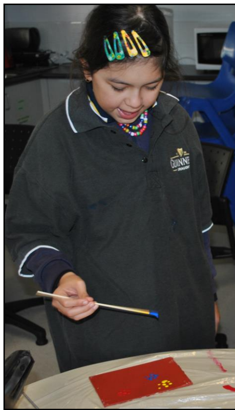
Just look at the concentration on everyone's face!