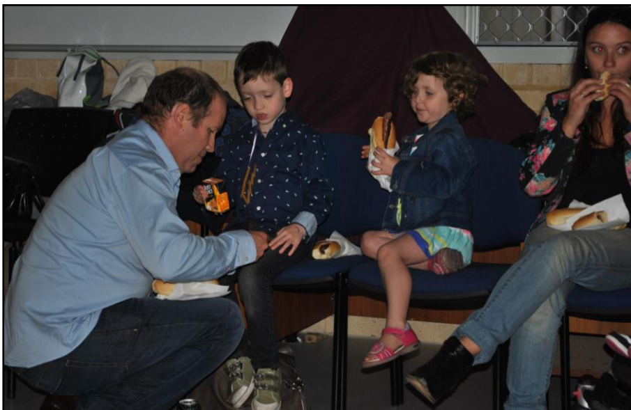
After all that dancing it was time to take a break and have something to eat...