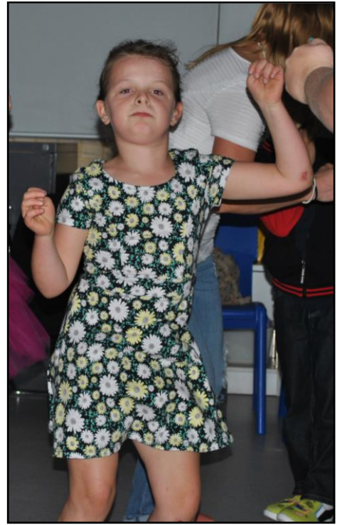
It wasn't long before the hips started shaking and the fancy moves came out!